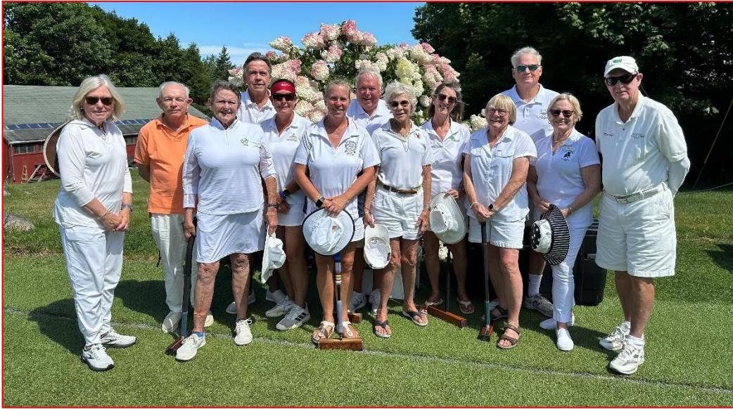
First Flight participants